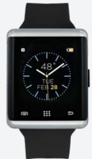
iTOUCH AIR SMARTWATCH