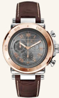
BEACON HILL LEATHER COLLECTION