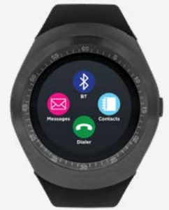
iTOUCH Curve SMARTWATCH