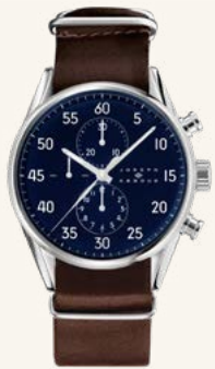
BERKSHIRE CASUAL COLLECTION