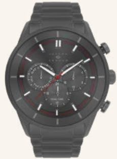
COPLEY SQUARE METAL COLLECTION